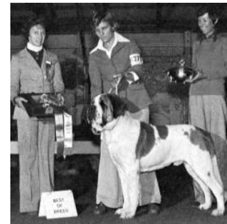
WD/BOW: Stanridges D G Cadet Of Bemar