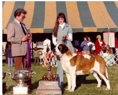
BOB: CH Stanridges Thor Of Opydke