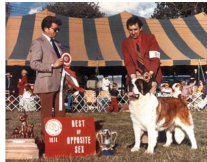
BOS: CH Sanctuary Woods Litany