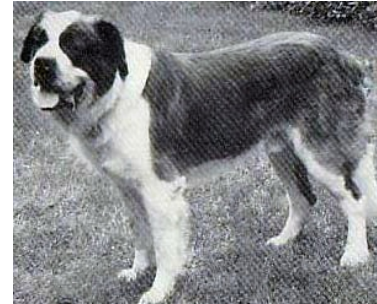
WD/BOW: Lord Von Sauliamt