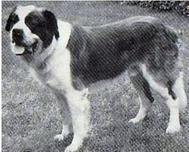
BOB: CH Lord Von Sauliamt