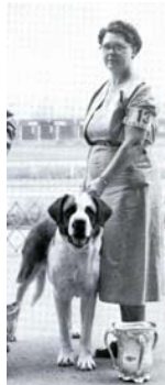
BOS: CH Sweet Sue of Brownhelm