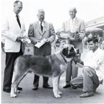
BOB: CH Heilmans Kris V Gero