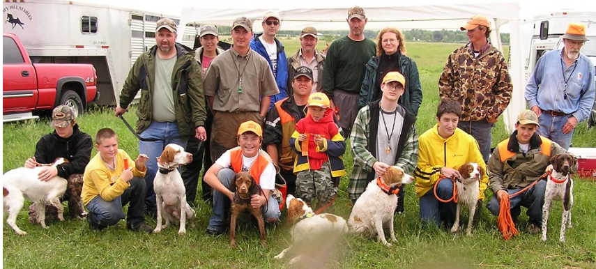
Participants of the Pointing Dog Youth Event