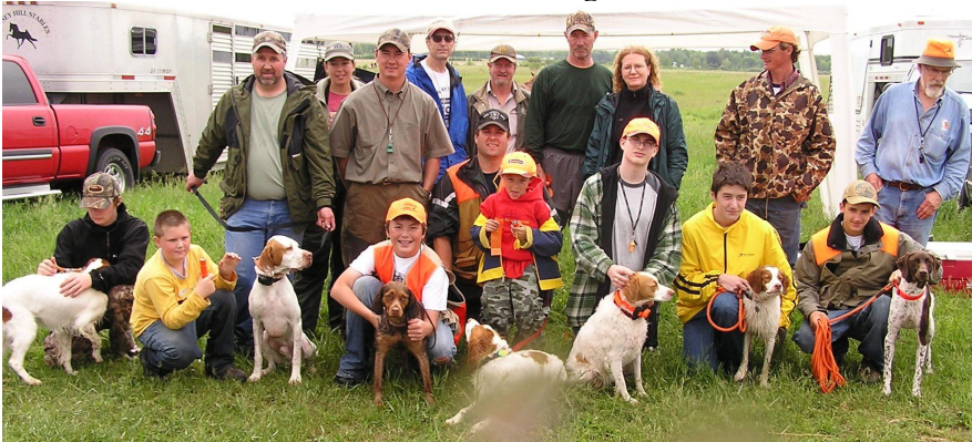
Participants of the Pointing Dog Youth Event

Hosted by St. Croix Valley Brittany Club www.scvbc.org